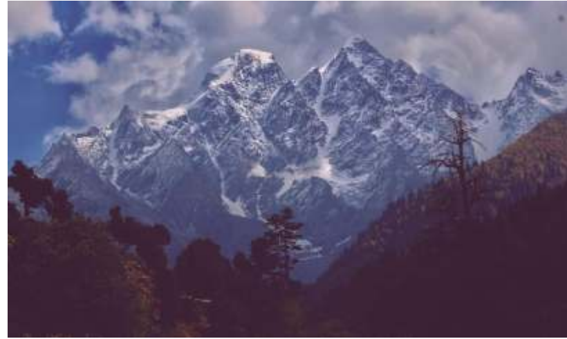
Javeria Baig (near Mahudand Lake, Swat)